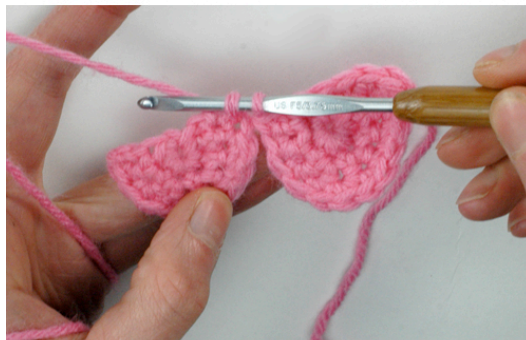
2. Join second lobe.