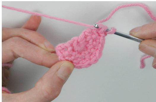
1. Join yarn in corner of lobe, then work across.

Holding one lobe with flat side facing away from you, attach yarn in upper corner and sc 6 across. Join other lobe and sc 6 across. DO NOT BIND OFF! (See photos below)