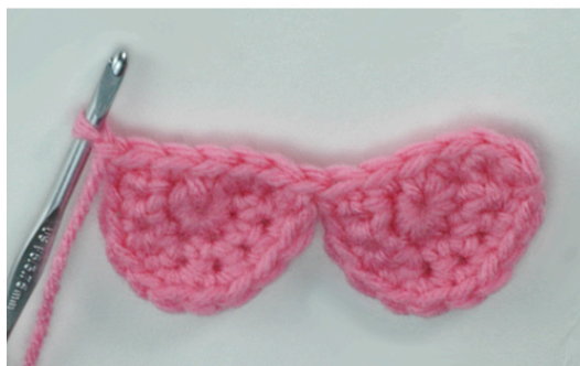
3. Work across (12 sc total)